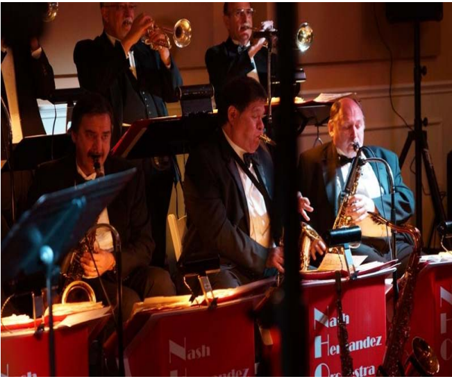
...the Nash Hernandez Orchestra