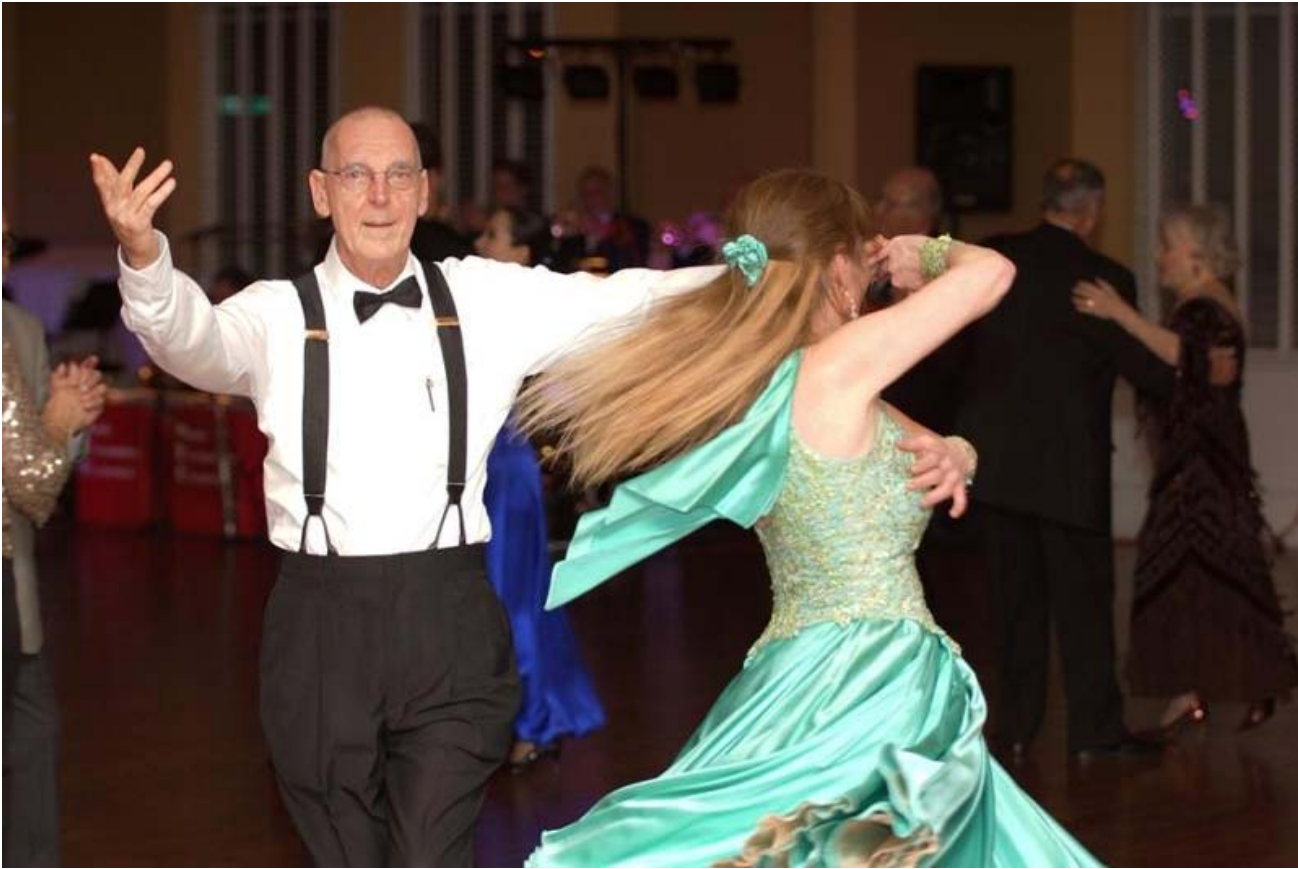
Dancing in the New Year in gowns & tuxes....

Celebrating the arrival of 2012 with ABD!