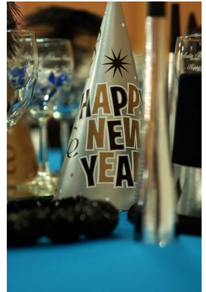
Hats, horns, toasting glasses