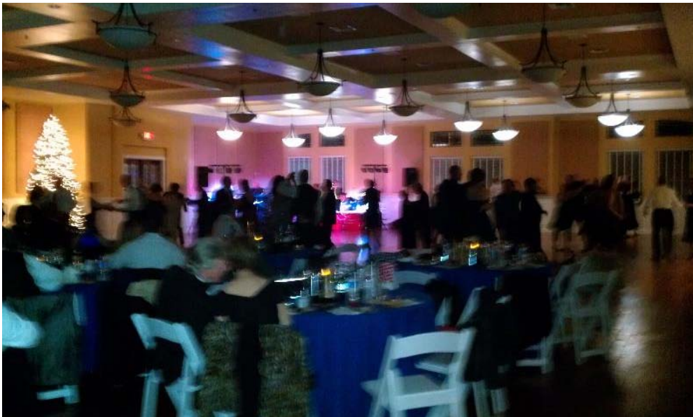
A New Year's Eve to Remember

Thanks to the more than 120 of you who danced the New Year in with us!